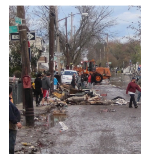
Redevelopment of San dy-devasted neighborhoods with inshabitants in New York

In Detroit, more than 200,000 residents have had their residential water shut turned off (approximately 1/3 of the city), and approximately 10% of these households have had their water bills placed on home property taxes. The number of homes that were foreclosed on because of a household's inability to pay the property taxes in 2015 was approximately 28,000, affecting nearly 80,000 people. This year there are about 18,000 tax foreclosures that affect about 51,000 residents.