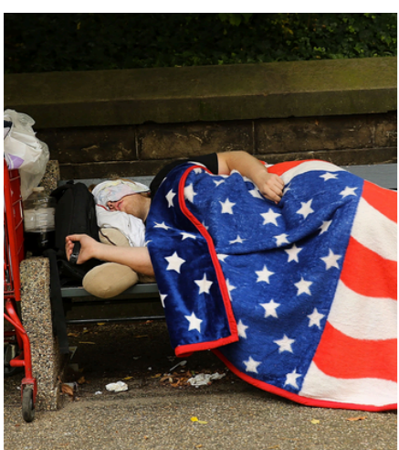
10 facts about being homeless in the USA by Bill Quigley - 2014