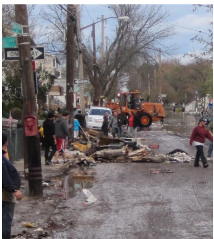
Redevelopment of Sandy-devastated neighborhoods with inshabitants in New York