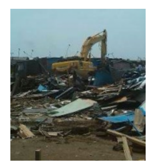
No evictions in Ghana (IAI and NO VOX)

The Commission on Human Rights and Administrative Justice (CHRAJ), has condemned the Accra Metropolitan Assembly (AMA), for embarking on a demolition exercise without adhering to international human rights standards.