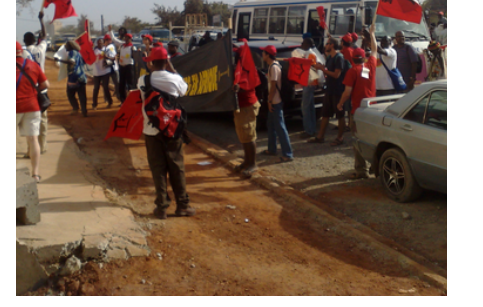
No evictions in Ghana (IAI Network)

1. Customary freehold: This is an interest that individuals or groups hold in a land, which is owned by a larger traditional community – the allodial owner – of which the interest holders are members or subjects. It is an interest that is transferrable to successors of the individual or subgroups un-